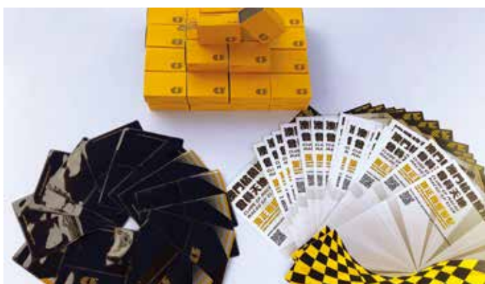
MACAO RESIDENTS SIGNING UP AS NEW MACAU GP CLUB MEMBERS RECEIVE THE LATEST NEWS ABOUT THE EVENT AND EXCLUSIVE SOUVENIRS!