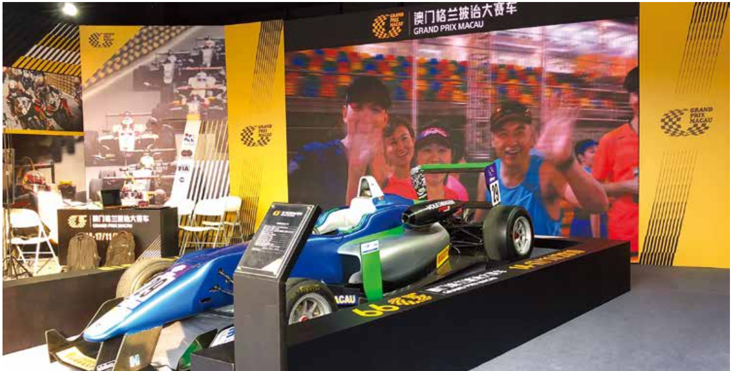
THE MACAU GRAND PRIX PROMOTIONAL BOOTH AT THE CHINESE F1 GRAND PRIX IN APRIL

It has already been an action-packed year so far for the Macau Grand Prix Organizing Committee (MGPOC), with a busy schedule of promotional activities designed to both entertain and educate.