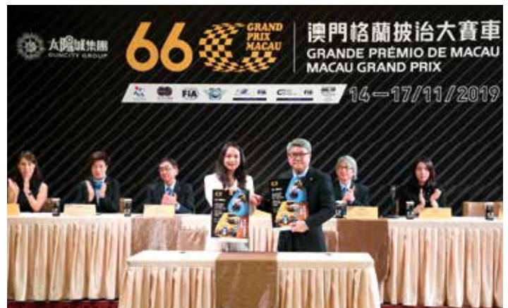
FOOD4U RETURNS AS MACAU TOURING CAR CUP TITLE SPONSOR FOR THE SECOND YEAR

Suncity Group is the title sponsor of the Macau Grand Prix for the sixth consecutive year, while Sociedade de Turismo e Diversões de Macau (SJM) continues as title sponsor for the Macau GT Cup – FIA GT World Cup for the fifth consecutive year and FOOD4U returns as Macau Touring Car Cup title sponsor for a second year. In addition, the safety, medical, rescue and working vehicles for the event are sponsored by BMW Concessionaires (Macau) Ltd. for the third consecutive year.