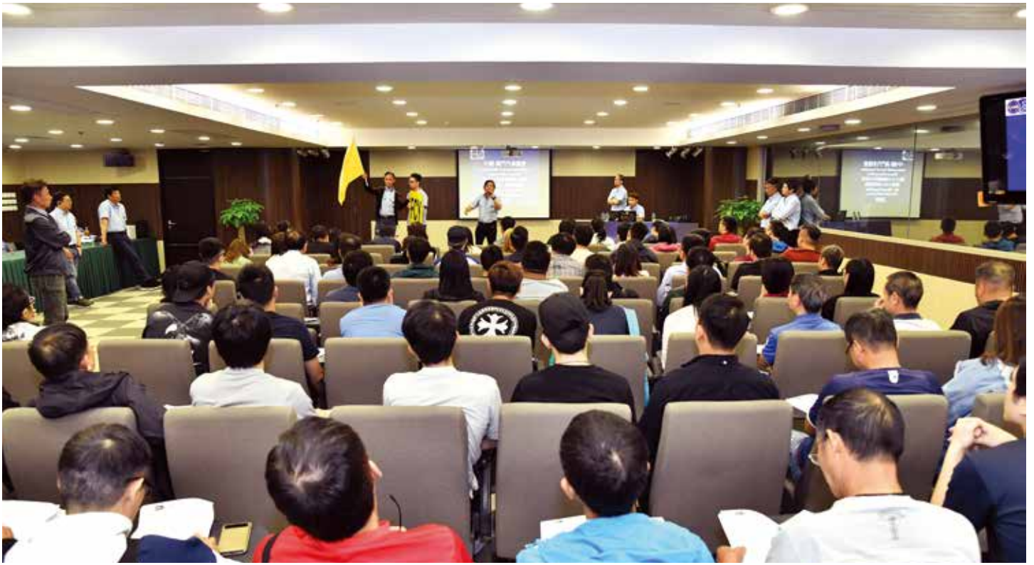
MACAU VOLUNTEERS UNDERTAKE AAMC TRAINING SESSIONS TO BECOME MARSHALS FOR NOVEMBER'S GRAND PRIX