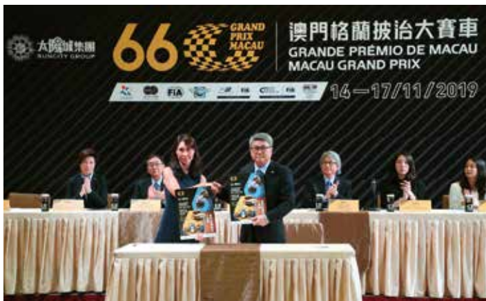
SOCIEDADE DE TURISMO E DIVERSÕES DE MACAU (SJM) CONTINUES AS TITLE SPONSOR FOR THE MACAU GT CUP – FIA GT WORLD CUP FOR THE FIFTH CONSECUTIVE YEAR