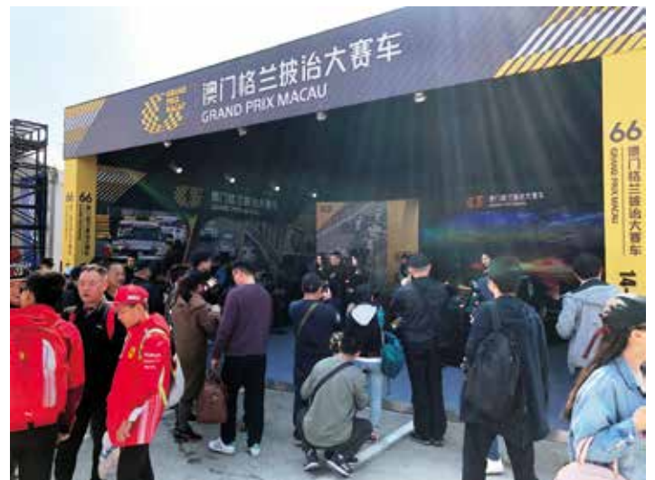
THE EXPERIENTIAL ACTIVITIES AT THE MACAU GRAND PRIX BOOTH WERE POPULAR WITH VISITORS

During the 2019 Chinese F1 Grand Prix, the MGPOC was invited to present a Macau Grand Prix booth at the Shanghai International Circuit's Fountain Square, promoting the event and giving fans from around the world a chance to learn more about the Grand Prix. The booth featured the 2016 Formula 3 Macau Grand Prix-winning Dallara Volkswagen of Portugal's António Félix da Costa, which visitors were able to view and take pictures of close up, and virtual reality racing simulators for fans to experience the thrill of racing on the Guia Circuit. The Macau Grand Prix booth proved a must-see attraction for hundreds of Shanghai residents and car racing fans across the globe with a lively, bustling atmosphere during the F1 Grand Prix.