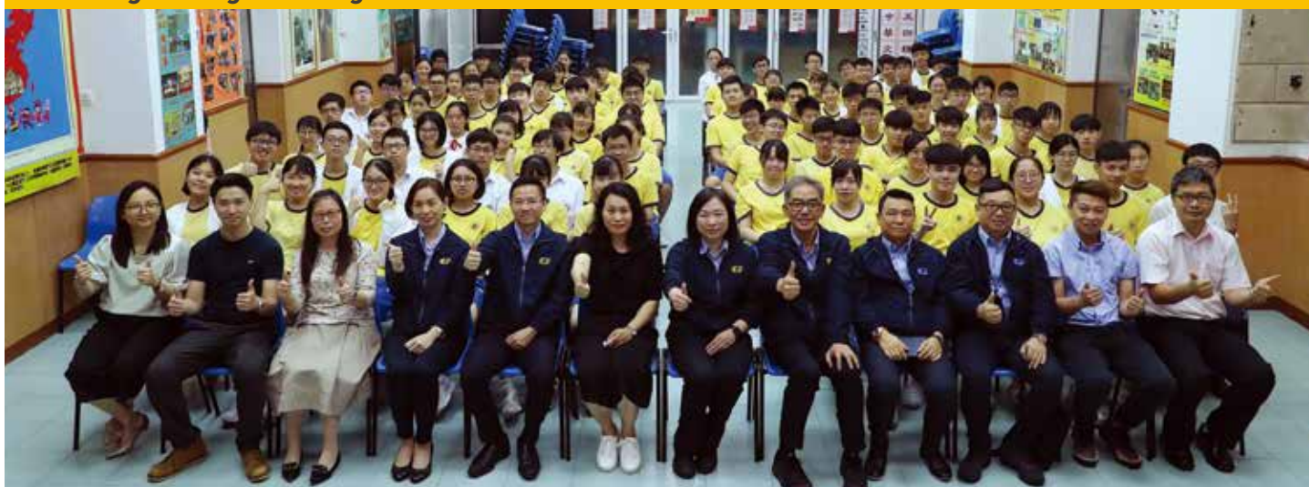
STUDENTS OF THE POOI TO MIDDLE SCHOOL POSE WITH MGPOC MEMBERS FOLLOWING ONE OF SEVERAL '2019 UNDERSTANDING THE MACAU GRAND PRIX SHARING SESSIONS'

The MGPOC has continued to conduct educational activities, and has already held "2019 Understanding the Macau Grand Prix Sharing Sessions" at different institutions including the Macao Polytechnic Institute, the Institute for Tourism Studies, Pooi To Middle School, and Kwong Tai Middle School, with guest speakers sharing their experiences and the fun of preparing for the Grand Prix.