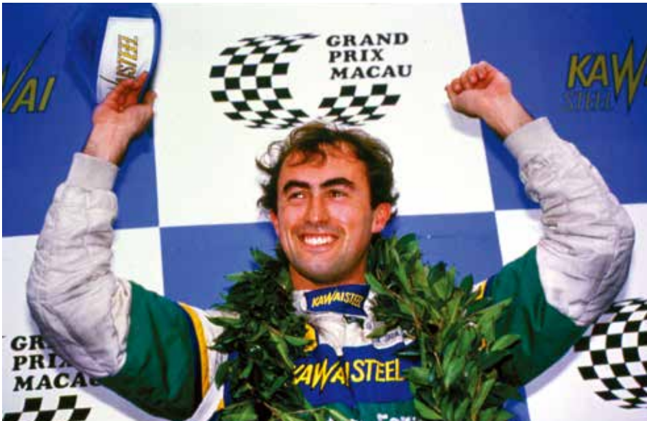
DAVID BRABHAM CELEBRATES HIS 1989 FORMULA 3 MACAO GRAND PRIX VICTORY

When David Brabham last visited the Macao Grand Prix for its Diamond Jubilee in 2013, the 1989 Formula 3 Macao Grand Prix winner remarked on the event's iconic status. "I think the Macao Grand Prix has been able to keep its identity," he said. "I've always had an interest in Macao and how important it is for young drivers. From my personal view, it's still highly regarded. For a driver to win Macao is still very prestigious."