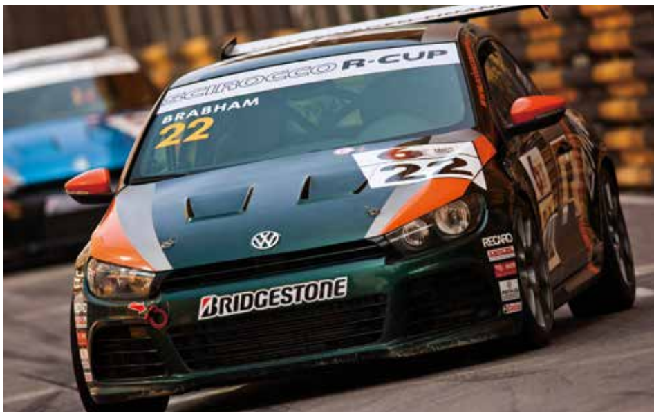
DAVID BRABHAM TOOK PART IN THE SCIROCCO R CHINA MASTERS CHALLENGE AT THE 60 TH MACAU GRAND PRIX

He recalled then what had changed – and what had remained the same – since 1989.