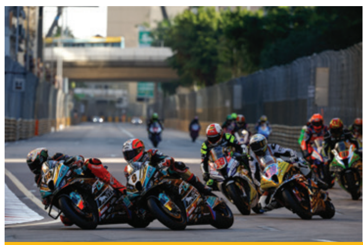
THE INCLUSION OF THE FAMOUS MACAU MOTORCYCLE GRAND PRIX ON THE PROGRAMME MAKES THE MACAU GRAND PRIX UNIQUE

The Macau GT Cup – FIA GT World Cup for sportscars has become a highlight of the event and a definite fan favourite. Once again, the world's leading GT3 drivers will