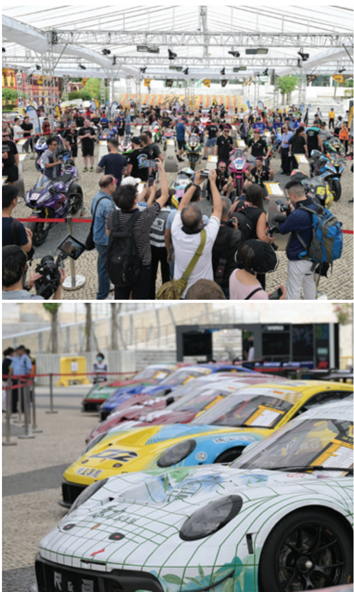
THE MACAU GRAND PRIX AUTO SHOW IS A UNIQUE OPPORTUNITY TO SEE THE COMPETITION VEHICLES UP CLOSE

And don't worry if you have to leave your seat in the stands over the Grand Prix itself. The live stream will be beamed via giant screens located across the city, so you won't miss a moment!