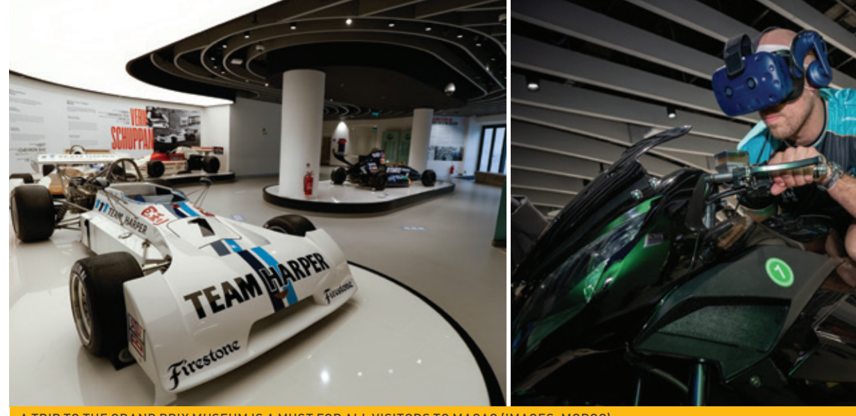
A TRIP TO THE GRAND PRIX MUSEUM IS A MUST FOR ALL VISITORS TO MACAO